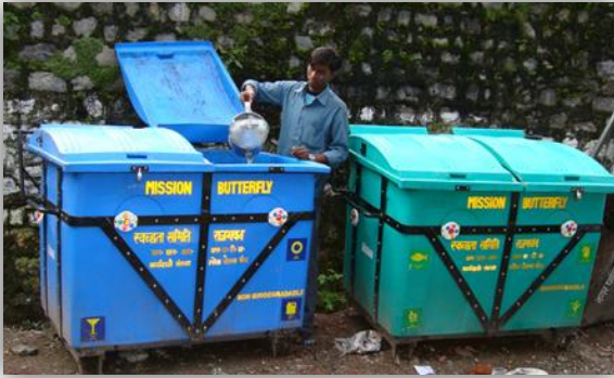
Mission Butterfly bins

Today there are ten towns and cities such as Lucknow, Allahabad, Agra, Haldwani, Bhowali etc. with tens of thousands having marched under the banner of My Clean , with ribbons, banners, oaths and posters used.