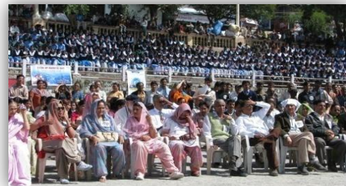
Celebrating in the town centre (The Flats)