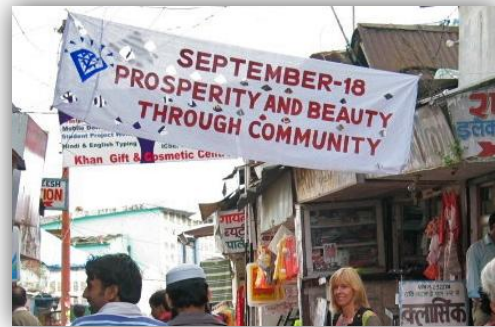
The possibility for Nainital on the banner