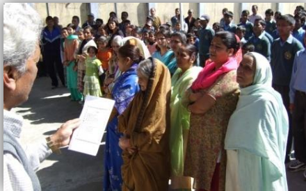
Taking the oath