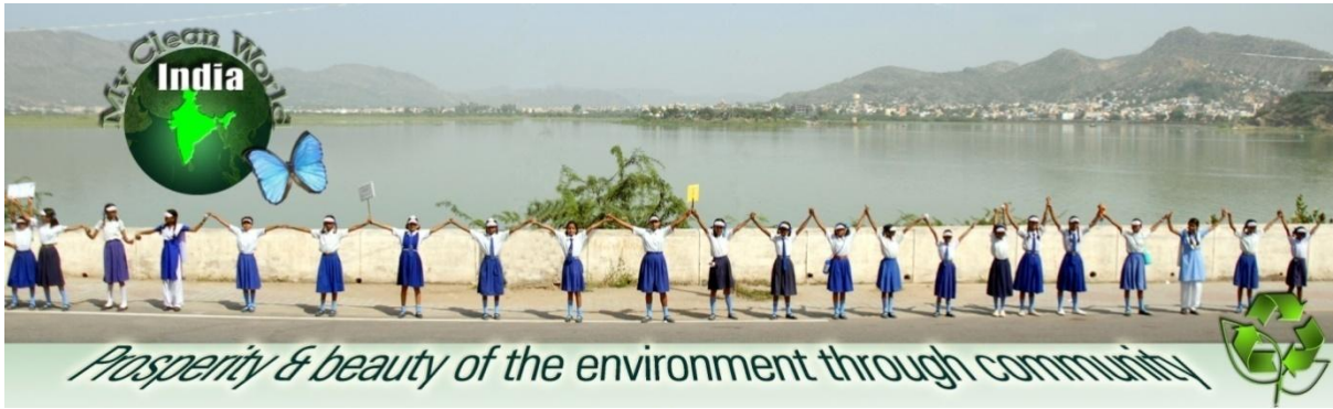
Ten kilometres of students around the lake in Ajmer Rajasthan